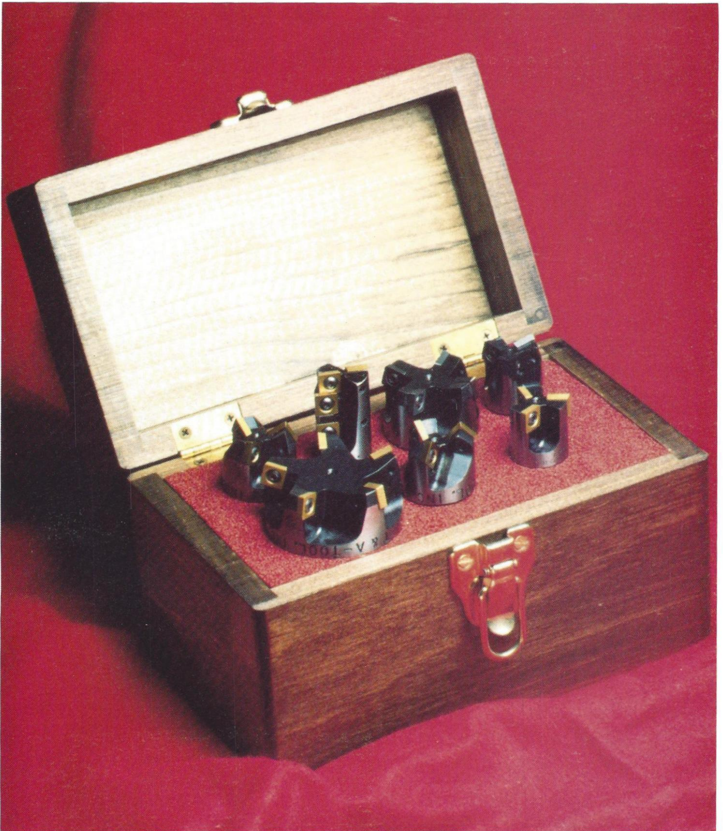
MILLING CUTTER SET ——— MC 7 - 1N